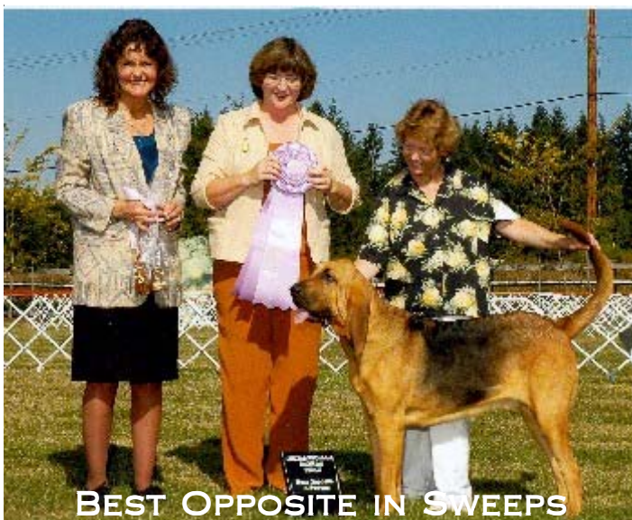
BEST OPPOSITE IN SWEEPS YAHOO'S TEN DOLLAR MAN