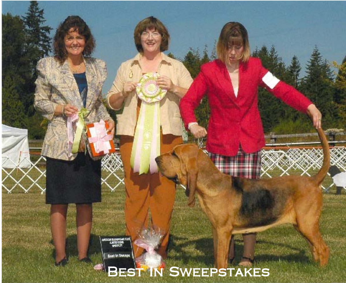
BEST IN SWEEPSTAKES