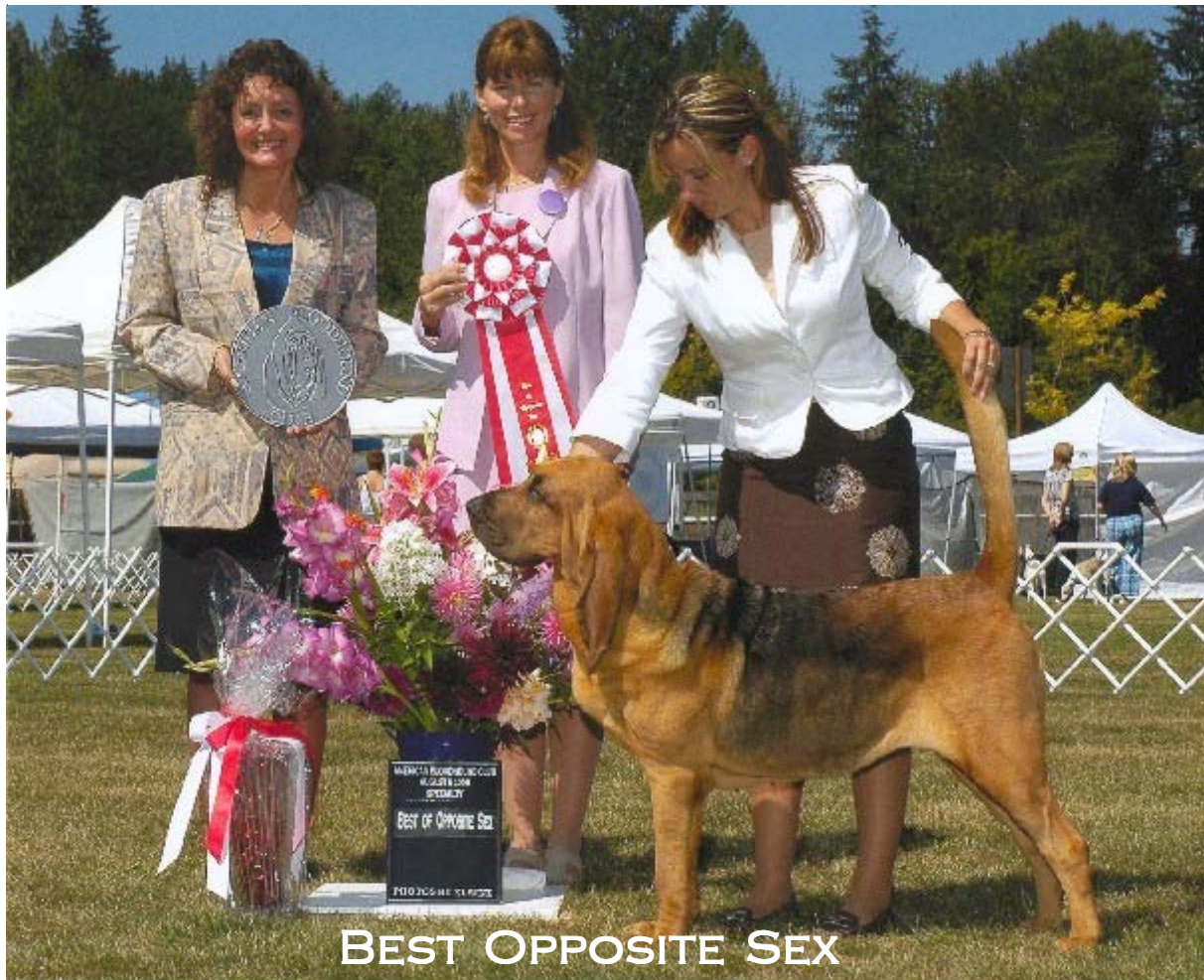
BEST OPPOSITE SEX