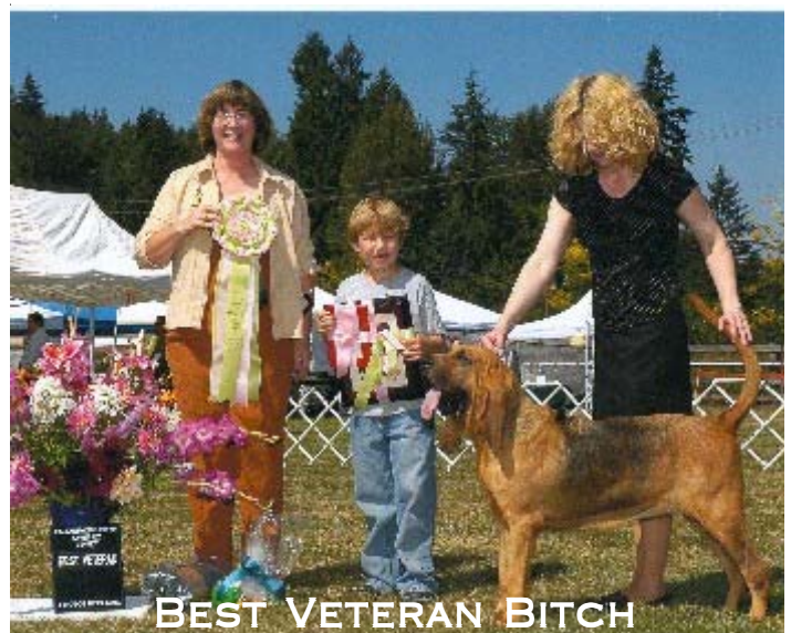
BEST VETERAN BITCH CH SAPPHIRE'S AC COBRA