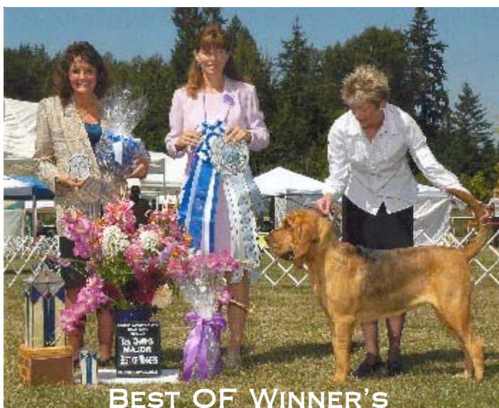
BEST OF WINNER'S