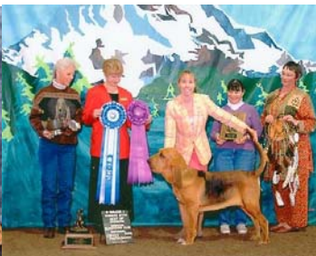
CH Nunya's Russet Hideaway CGC