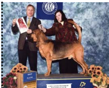
CH Sherick's Dakota Wild Pitch CGC

Nunya's "Catch" Litter Fingers crossed for Spring of 2008 Expected Black and Tan