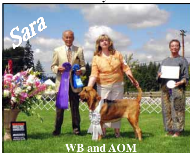
WB and AOM