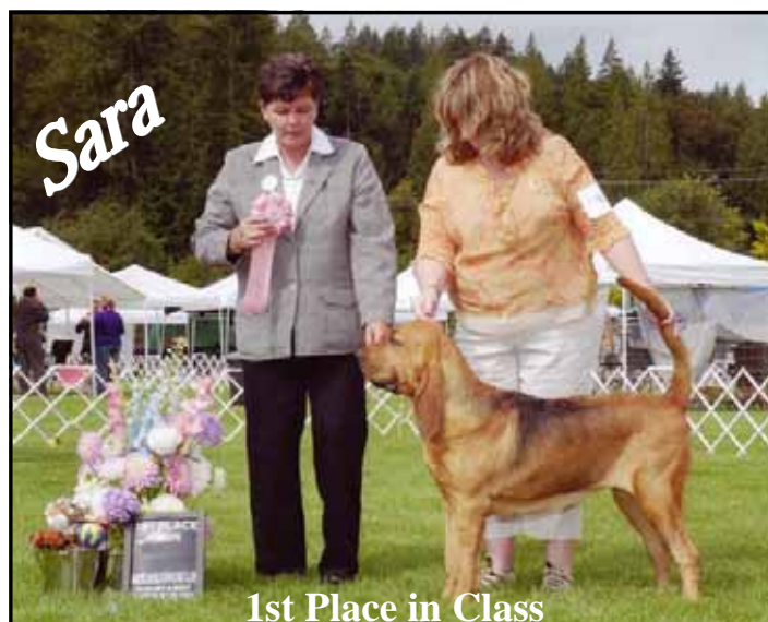
1st Place in Class