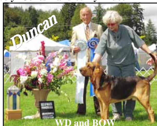
WD and BOW

Soonipi Moonlight Serenade MLH Owned by: Kirsty Regan Hinton