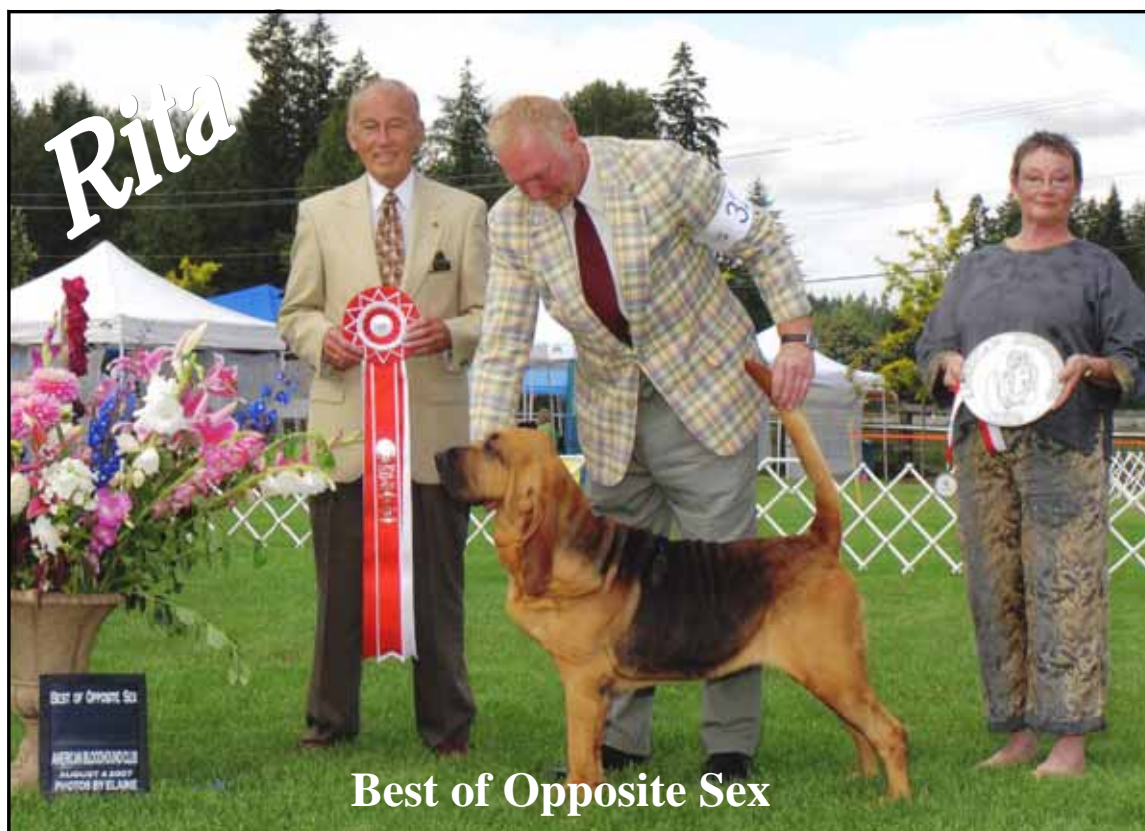
Best of Opposite Sex