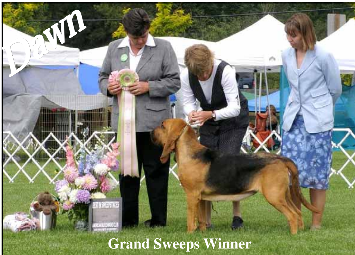
Grand Sweeps Winner