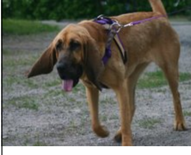
Dixie at work

Keith Pikett were on task, on the road, and on their feet throughout the weekend; judge Sid Harty, sidelined with a case of bacterial pneumonia *, provided valuable assistance with transport and played host to all guests.