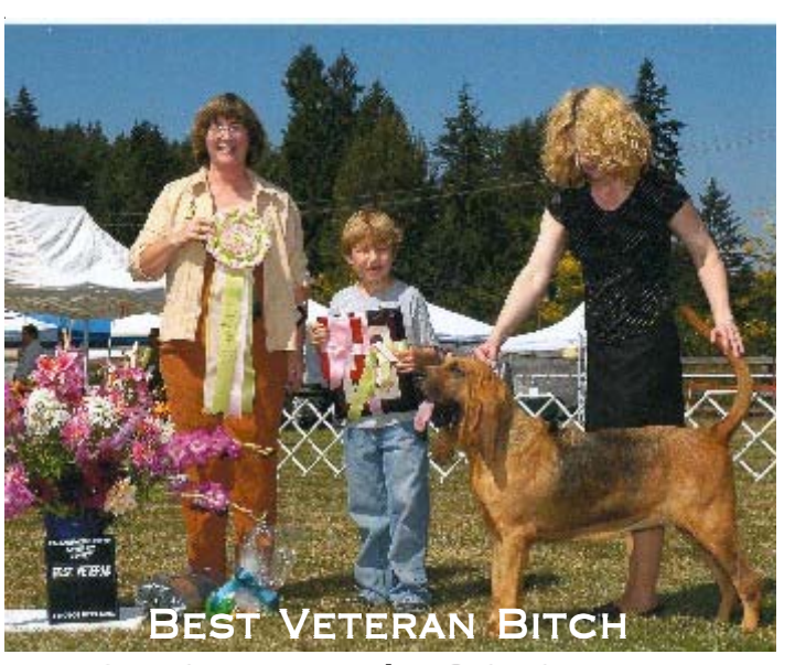
CH SAPPHIRE'S AC COBRA