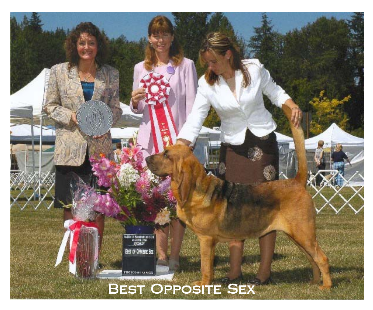
CH QUIET CREEK'S MI AMOR