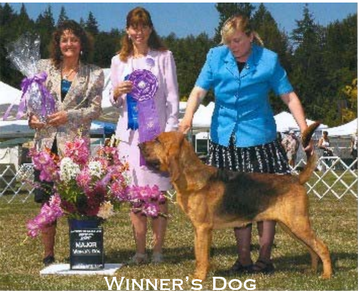
HEATHER JUST KEEPS ON KNOCKING