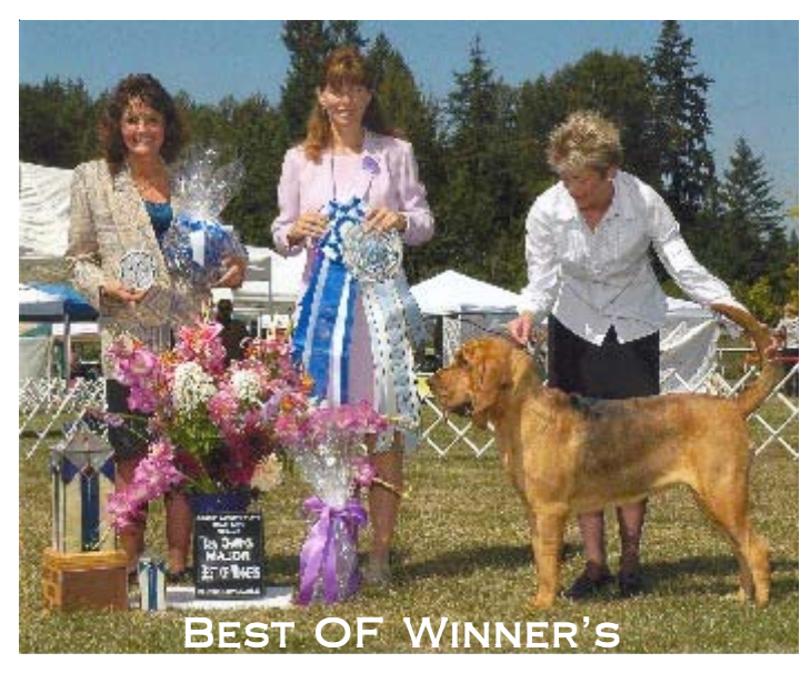
CH HOUNDWALKER'S LUZ DE LUNA