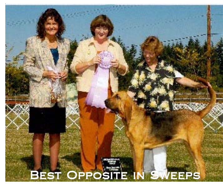
YAHOO'S TEN DOLLAR MAN