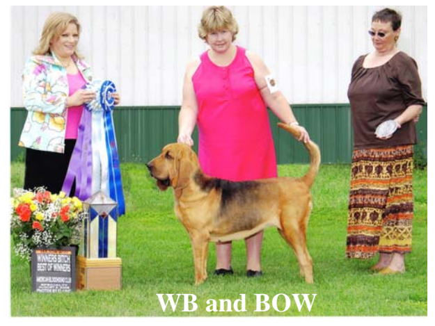
Soonipi Moonlight Serenade MLH Owned by: Kirsty & Regan Hinton