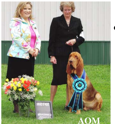
Ch Heathers Father and Son