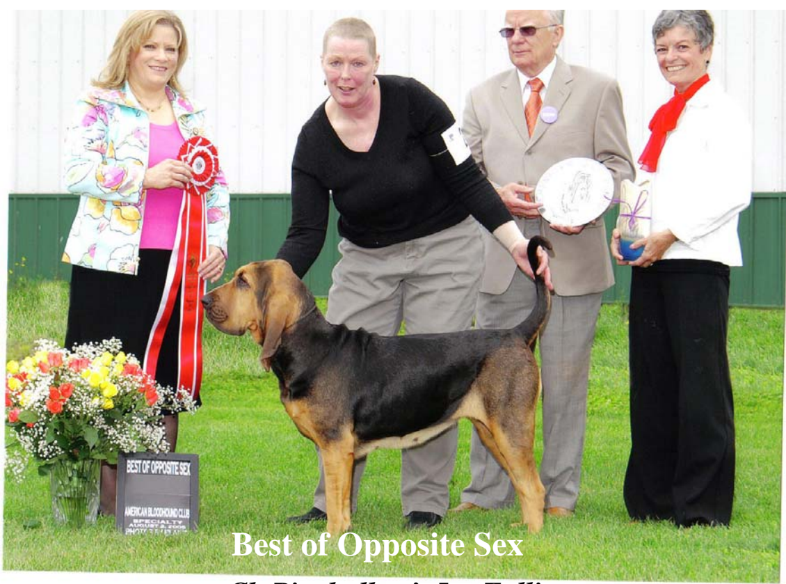
Ch Pinehollow's Ice Follies Owned by: Janis Hardy