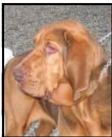
(Rescue Continued from page 2)