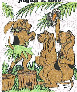
Northwest Regional Specialty