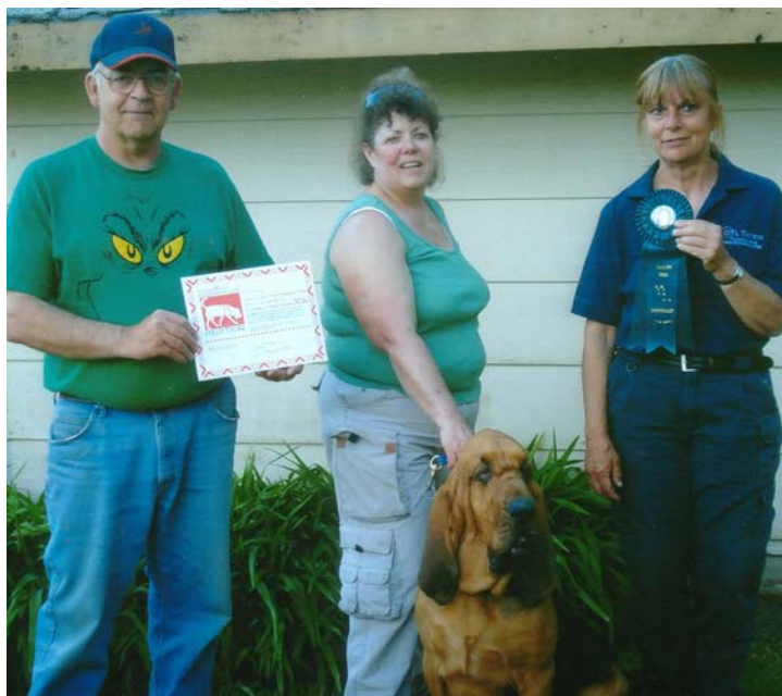
NUNYA'S M-AZING McSHAMUS O'MSTRMD - NEW MT!!!