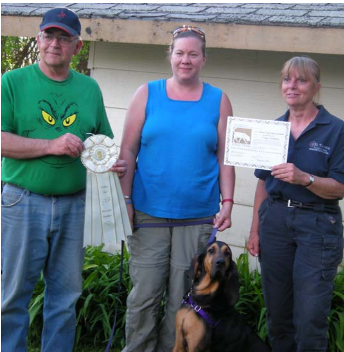
BETTER HANDS BLUES OF THE FOREST AM MTX CAN MTI CGC NEW MTX!!!