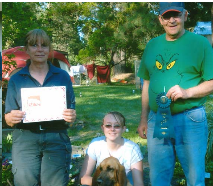
LITTLE "D" - NEW MT!!!