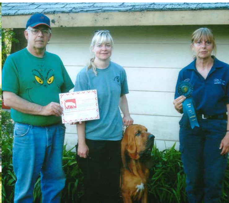
CH. NUNYA OR IDA RATHR B TRAKIN - NEW MT!!!