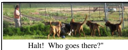
Halt! Who goes there?"

Over Memorial Day weekend, forty-eight guests – 28 humans, 20 canines – traveled from points in Washington, Oregon, and Idaho and such far-flung locations as British Columbia, Canada, and Texas to take part in the Clyde Reed Memorial trailing trial in