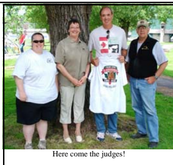
Here come the judges!