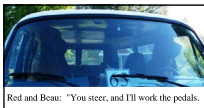
Red and Bear: "You steer, and I'll work the pedals."