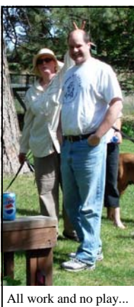
All work and no play...