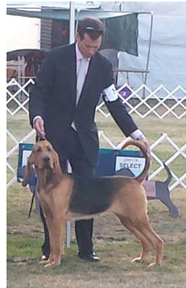
"Pebbles," Huggables Top Seller at the Kocars