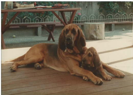
Crockett and Wellesley